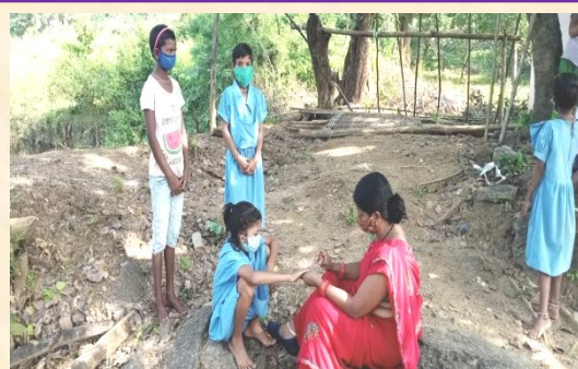
Staff checking and taking care of hygiene of students