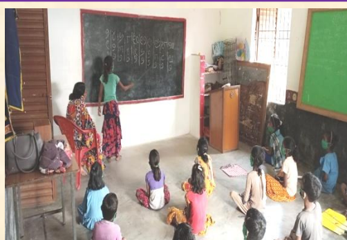
Classroom transaction going on at Kespanka primary school