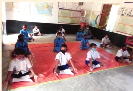
Primary school children are practicing meditation at L.Nuasahi village, Ganjam