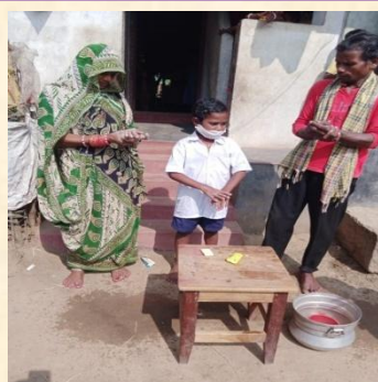
Door to door hand wash and mask wearing campaigning for primary school children at Gojiakhamana village, Ganjam