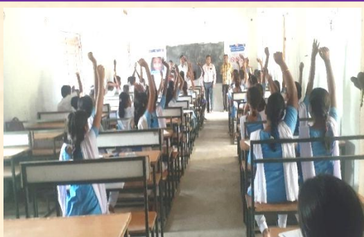
Community Coaching Centre at Goudagotha, Ganjam