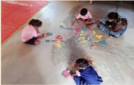
Preschool children are taught colour matching through TLM