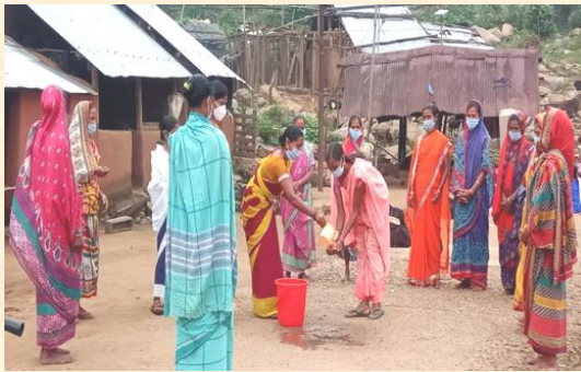
Awareness on Hand wash to Women at Community level