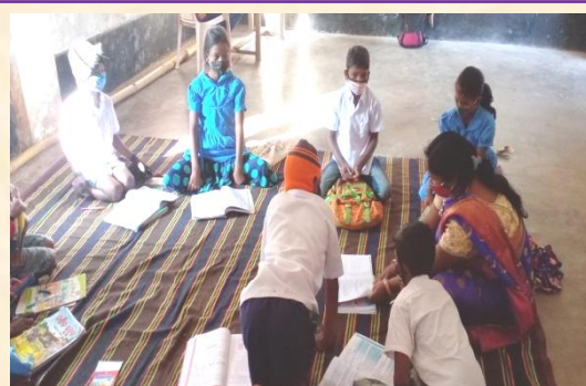
Primary school students are interacting with our Inclusive Education staff at Siangbali village, Kandhamal