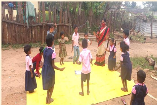
Joyful learning for pre-school children at village Siangbali, Kandhamal district

Supported by KINDERMISSIONSWERK, Germany: (Project No- D200317042)