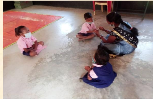
Preschool children are taken care of their hygiene