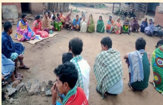
Community meeting held to select village edu-leaders at village Sarapadi, Ganjam