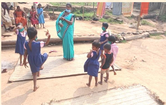
Preschool children are learning actions through Joyful learning