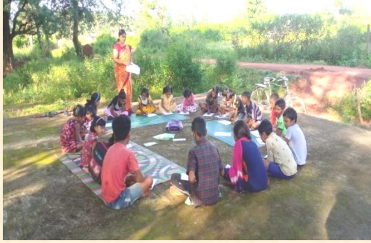
School children are taken care for their study at community, at village Siangbali, Kandhamal