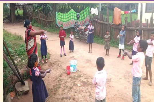
Awareness on Hand wash to pre-school children at Community level

Supported By: KINDERMISSIONSWERK, GERMANY