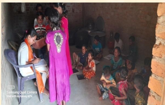
Edu-leaders is teaching village children at community coaching centre at Gojiakhamana village, Ganjam