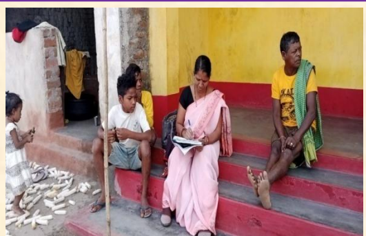
Survey and identification of meritorious students at village Sagadabasa to register for JNV vidyalaya