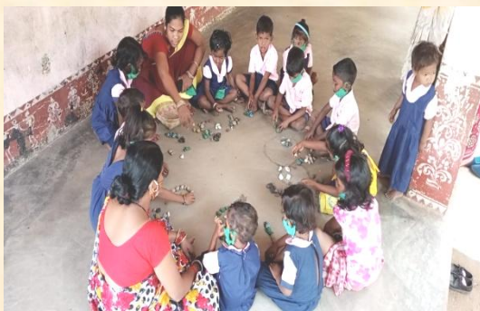
Children are learning to count using local based TLM