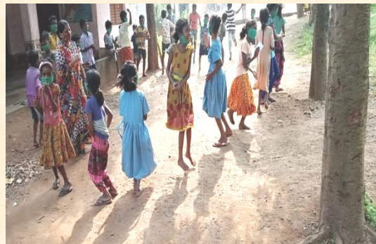
Primary school girls are playing at community, Kespanka, Ganjam