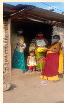
Door to Door visit and distribution of THR by SFDC staff at Balipadar village, Ganjam