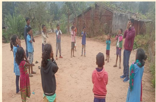
Primary school children are playing Play for Peace at community, at village Pudrajola, Kandhamal