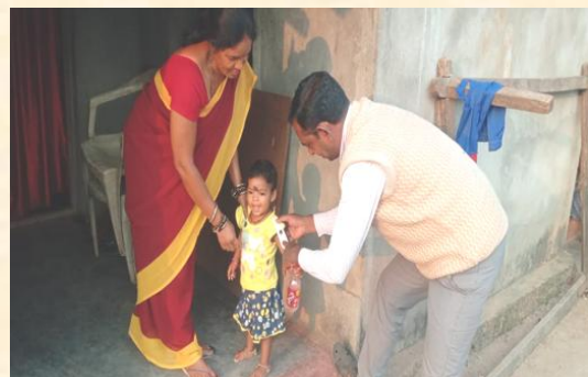
MUAC measurement for identification of malnourished children and sensitizing to parents by staff