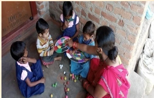
Staffs are conducting joyful learning through TLM at door steps