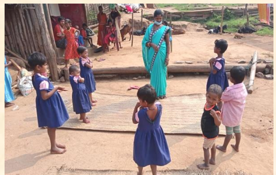
Joyful learning conducted by staff at Sarapadi village, Ganjam