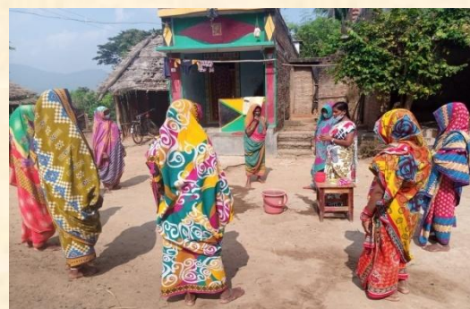
Staff orienting on hand wash to community women at Gojiakhamana village, Ganjam