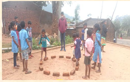
Development of motor skill for children through games