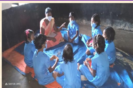
Primary school girls students are interacting with our Inclusive Education staff at L.Nuasahi village, Ganjam