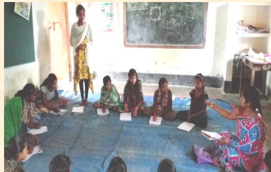
Inclusive education staffs guiding to the primary school children during their study time in the school.