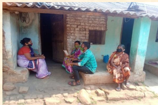
Survey and identification of meritorious students at village Siangbali, Kandhamal, to register for Orissa Adarsh Vidyalaya