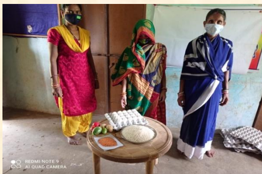
Take Home Ration provided to mother and children