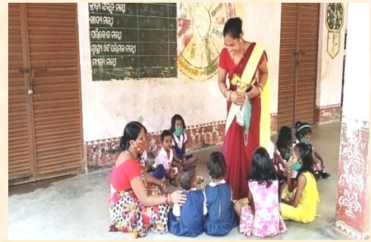
AWW distributing sweets to preschool children before starting joyful learning at Kespanka village, Ganjam