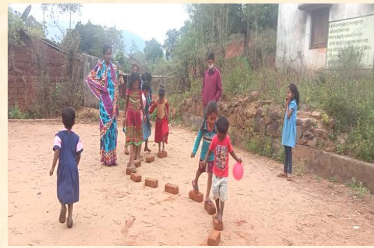
Development of motor skills for pre-school children through games (off school activities)