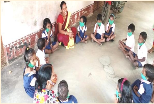
Preschool children are taken care by the Anganwadi Worker