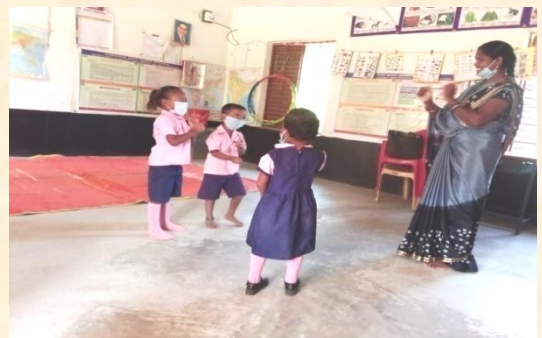
Joyful learning at L.Nuasahi village AWC