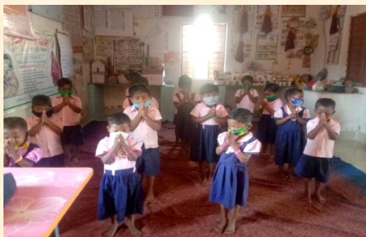
Pre-school children practicing daily prayer to develop virtues