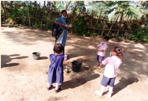
Practicing Hand wash for children