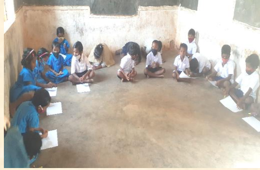
School children are participating in the talent search programme during the international Peace day