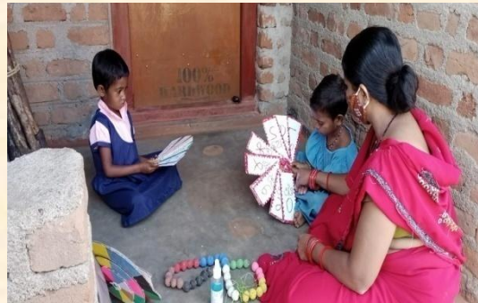
Door to door visit of staff to conduct joyful learning and by using local made TLM amidst the pandemic