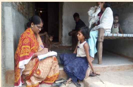
Survey and identification of meritorious students at village Sagadabasa to register for JNV vidyalaya