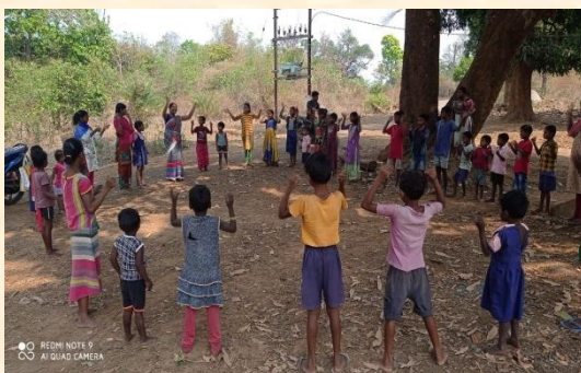
Play for peace activities conducted at village Kespanka, Ganjam