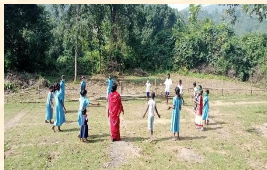
Play for peace activities conducted for primary school children at Kurubandha village, Ganjam