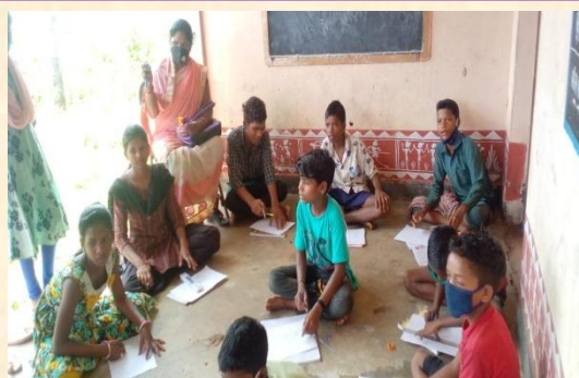
Talent search programme at Siangballi school Veranda