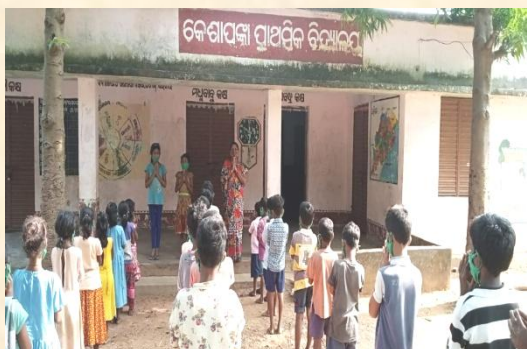
Primary school children are practicing daily prayer at Kespanka primary school, Ganjam