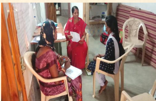
Staff orienting to the village level Sikhya Sathi (Edu-leader) on classroom transaction at community coaching centre (HDC)